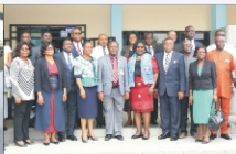
Group photograph of UniPort and NDNC officials