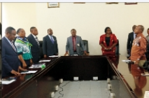
Officials of the University and NDNC rise for the University Anthem