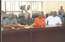
A cross-section of officials of NDNC