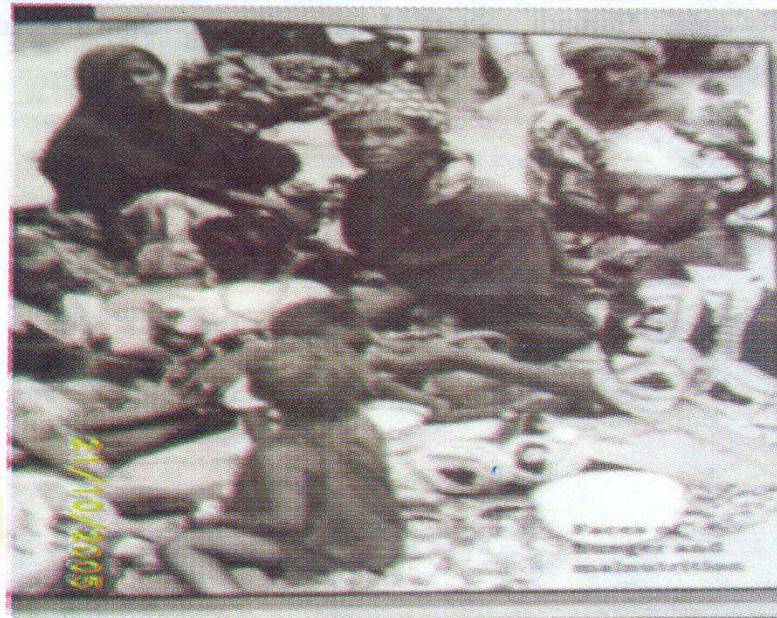
The Food and Nutrition Situation in Nigeria

Hunger and malnutrition in Nigeria are more severe now than ever before. It has been reported that the percentage of Nigerian households that are food insecure has risen from 18% in 1986, to over 40% in 1988. Malnutrition is widespread and its prevalence is high. Poverty, inadequate investment in the social sector, inadequate dietary intake, and disease has been identified as the