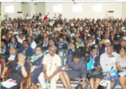
A cross-section of staff at the event