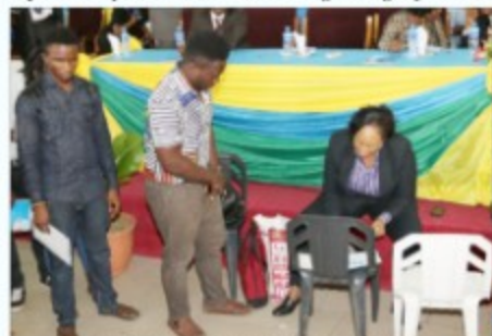
Scene from a playlet by UniPort Theatre and Film Studies troupe