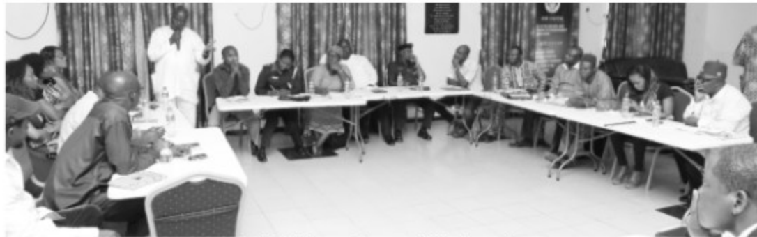
Stakeholders at the roundtable discussion