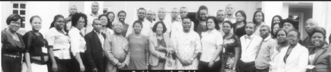
Participants at the Workshop