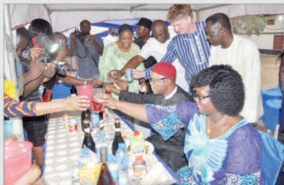
Time to clink the glasses