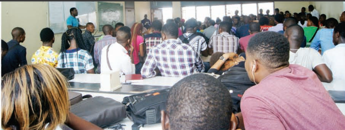
Geology student at the lecture

"I currently work as an Exploration Geologist with the Shell Petroleum Development Company, here in Nigeria and I am a member of AAPG and a Volunteer Visiting Geologist. What this Volunteer Visiting Geologist programme is about is to get people, who are in the industry, most importantly, those in the oil and gas sector to go to universities to explain some Petroleum Geosciences courses to the students. So I am here on one of such assignments and I hope that my mission would be beneficial to students of UniPort," Mr.