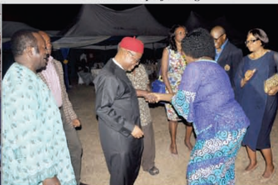
V-C, his wife and some Principal Officers on the dance floor