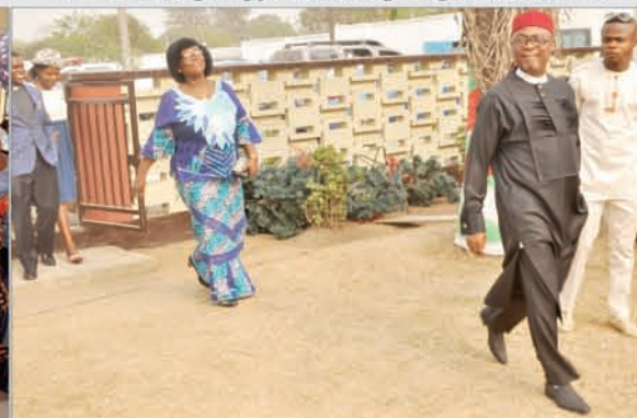
The Celebrant and his wife stepping into the reception venue