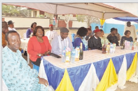
A cross section of guests