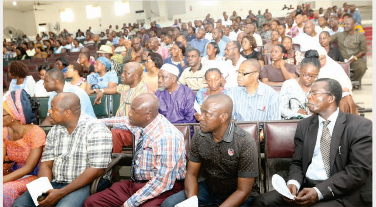
A cross-section of the audience at the meeting