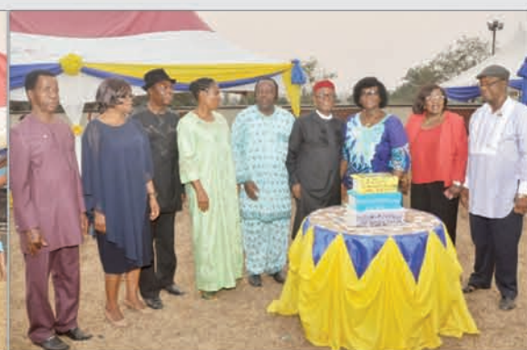
Chief celebrant (in red cap), supported by his wife and admirers about to cut the cake