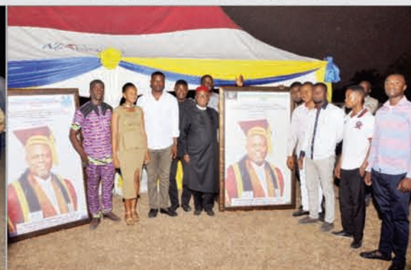
V-C and student leaders pose for a group photograph with his portrait