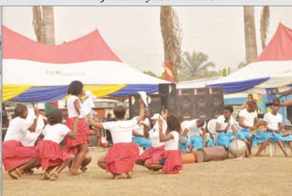
A dance troupe from the Dept of Theatre and Film Studies performing