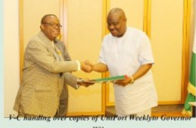
V-C handing over copies of UniPort Weekly to Governor Wike