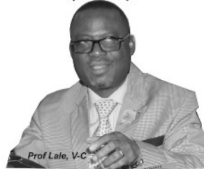
Prof Lale, V-C

delivery of the various TETFund projects within the contractual agreement for each project.