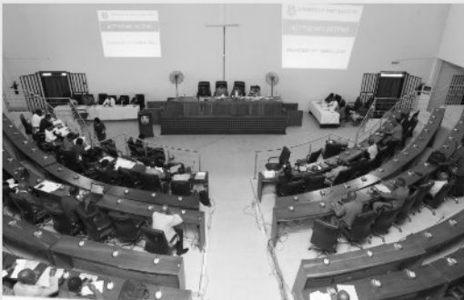
Senate in session