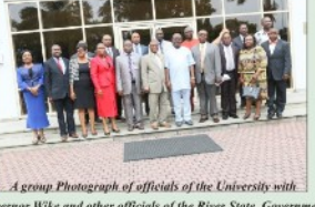
A group Photograph of officials of the University with Governor Wike and other officials of the River State Government