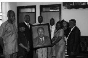
Staff of the DV-C, Academic's Office presenting a Portrait to their former boss (3rd left)

"When you work with people from diverse backgrounds and orientation, there is bound to be conflicts on the appropriate modalities to be adopted in accomplishing organisational goals, but the ability to manage such conflicts is what makes you a mature person. You are serving the institution and should not preoccupy yourself with matters that do not concern you. I want to admonish all of you to continue to work as members of the same team, who should show loyalty and respect to one another. When you do your job professionally, you will certainly receive the reward. Don't grumble when you are transferred to another Unit or Department and don't be rude to your superiors or subordinates. It is not good to go to work and be feeling sad in the office," he advised the staff, promising to always monitor their career progress.