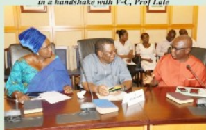
Prof Israel Owate (middle) Special Adviser to the Governor and other officials of River State Government