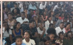
A cross-section of students at the Orientation