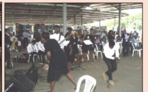
Students of the Departments of Theater and Film Studies and Music performing at the Orientation