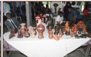
Various items produced by the students exhibited at the event