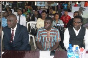
SIWES Coordinators at the event