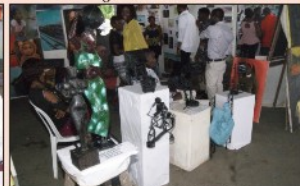
Participants at an exhibition stand