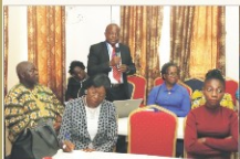
One of the participants making a contribution