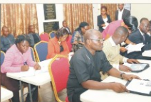
A cross-section of participants at the event