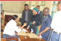
Participants registering for the Summit