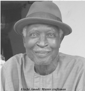
Elechi Amadi: Master craftsman

Amadi's characters are both communal players and