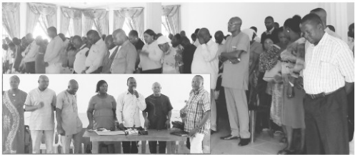
A cross-section of participants at the meeting. Inset: EXCO members of the Unions

The SSANU Chairman revealed that following JAC's message to all members of Congress, Management of the University invited the platform to a meeting on Tuesday, 28, 2016 to kick-start discussions on the issues raised. The various leaders of JAC pledged their commitment to the joint Congress members to take their message back to Management with a passionate appeal for the speedy implementation of all the outstanding allowances to ensure industrial harmony.