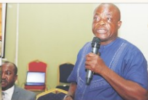
One of the Resource Persons making a presentation