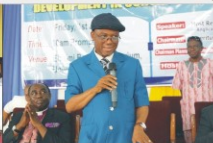
V-C addressing participants at the Lecture