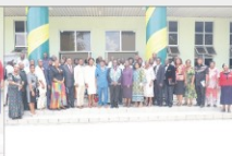
A group photograph of participants and organisers