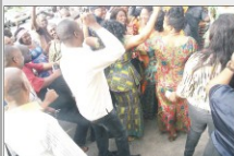
Another view of jubilant staff ushering in the V-C, Prof. Lale into the Senate Building