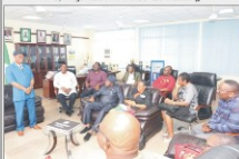
V-C (standing), addressing some well-wishers and staff in his office