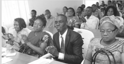
A cross-section of participants at the World Youth Skills Day

addressing the problems of unemployment and also foster national development.