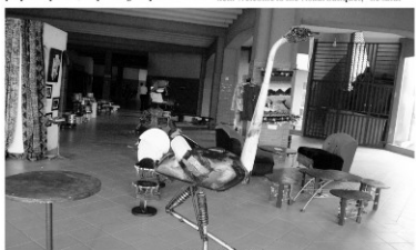
A view of the Exhibition