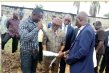
The Contractor explaining the architectural design of the building to the V-C