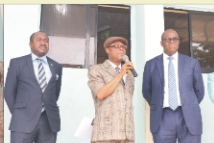
V-C addressing staff and students of the School