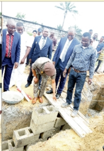
V-C performing the foundation laying ceremony