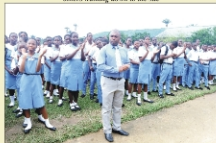
A cross-section of the students and a teacher