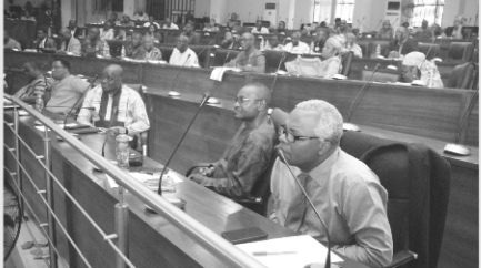
A Cross-section of participants at the Retreat