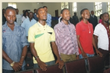
The audience and members of the High Table rise for UniPort Anthem