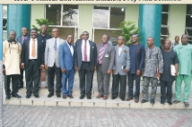
Group photograph of the Guest Lecturer (7 th right) and Senior Officers of the University