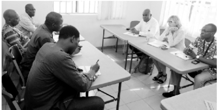
Officials of CGCS and British Council during the meeting