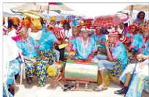
The famous Piiru Cultural Group from Orliri