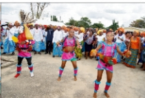
Cultural Group from Akwa Ibom State