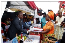
Sandwich students presenting 201 items to V-C and other Principal Officers