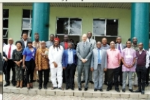
A group photograph of the participants