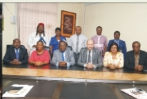
A group photograph of Principal Officers and lead speakers after the courtesy visit