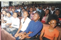
Another cross-section of participants