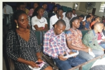
A cross-section of participants