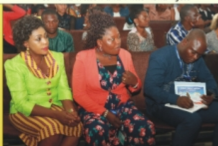
A cross-section of participants