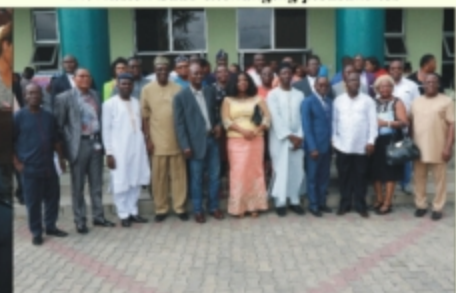
A group photograph of some participants after the opening ceremony