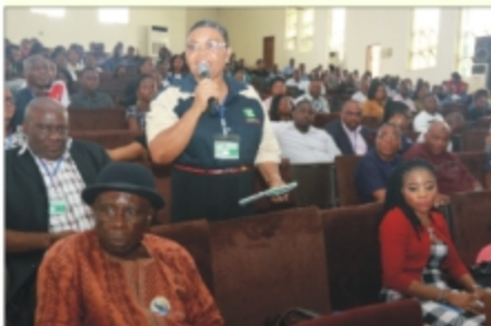
A participant asking question after the keynote presentation