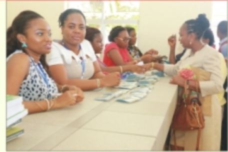
Participants registering at the Foyer of the Ebitimi Banigo Auditorium

T he Department of Linguistics and Communication Studies in the Faculty of Humanities hosted the 18 th National Conference of the African Council for Communication Education at the Ebitimi Banigo Auditorium from Wednesday, 26 to Friday, October 29, 2016. With the theme: Communication for Economic Development , the three-day Conference attracted Communication scholars from within and outside the Country. Our Cameraman, HEADMAN ALU captured pictorial highlights of the Conference as shown below: