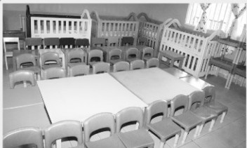
More refurbished chairs and baby cots

The new UPWA President expressed gratitude to God for the opportunity given to her to serve in her present position, promising to do all that is within her powers to improve on the commendable legacies bequeathed by her predecessors in office.