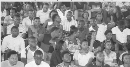
A cross-section of prospective Corps Members