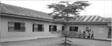
A view of repainted structure