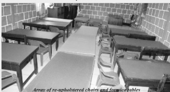
Array of re-upholstered chairs and formica tables