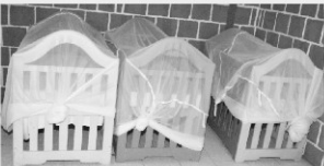
Baby cots covered with mosquito-treated nets