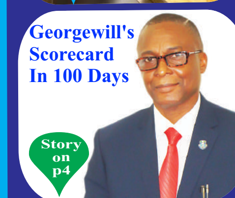
Georgewill's Scorecard In 100 Days