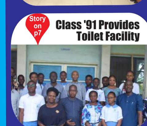
Class '91 Provides Toilet Facility