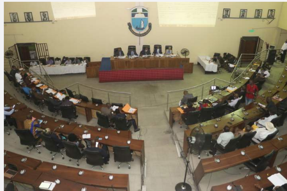
464th Senate in session