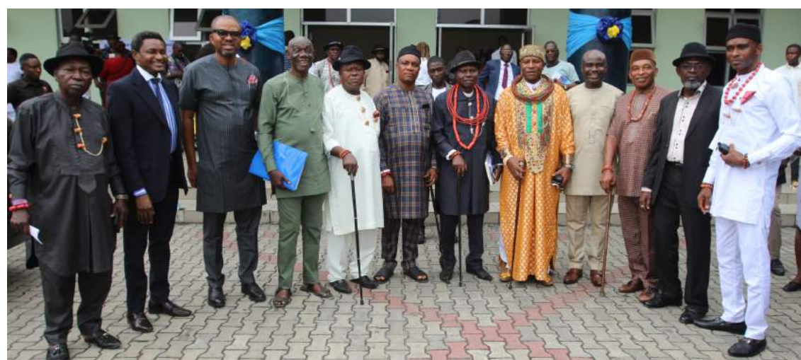
Dignitaries in a group photograph after the event