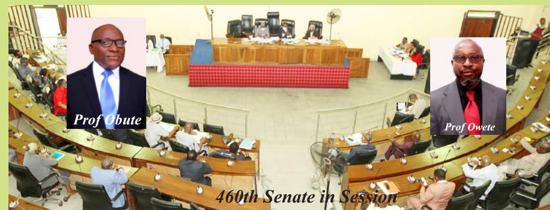
460th Senate in Session