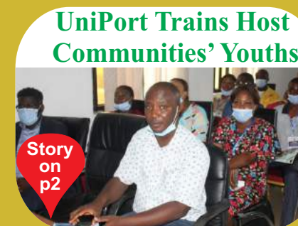
UniPort Trains Host Communities' Youths