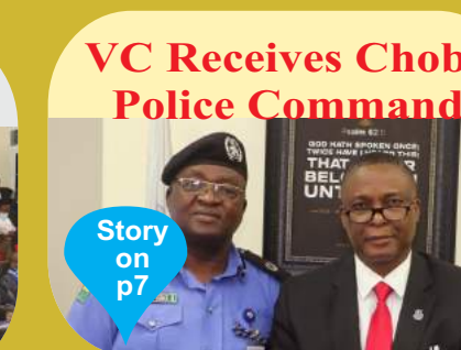
VC Receives Choba Police Command

A Publication of the Information, Publications and Public Relations Unit, University of Port Harcourt, Nigeria