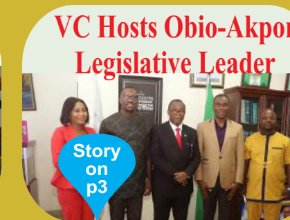
VC Hosts Obio-Akpor Legislative Leader