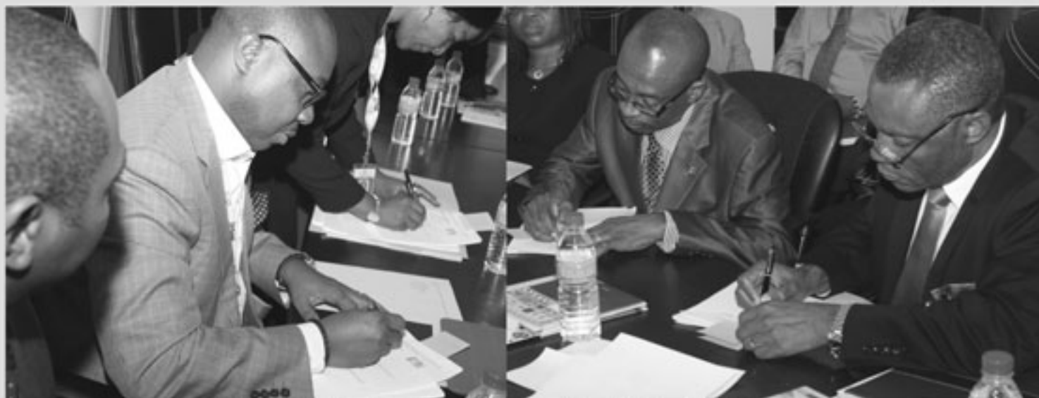
Signing of the MoU by officials of UniPort and RSSDA

This is the main thrust of the entrepreneurial policy of the administration. Now that this is in place, it is believed that in a few years, the University would produce successful agricultural entrepreneurs, who would drive the nation's economy.