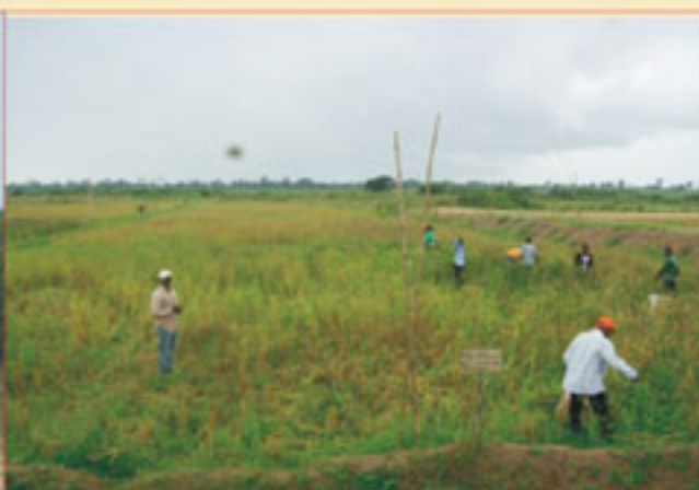
The rice farm