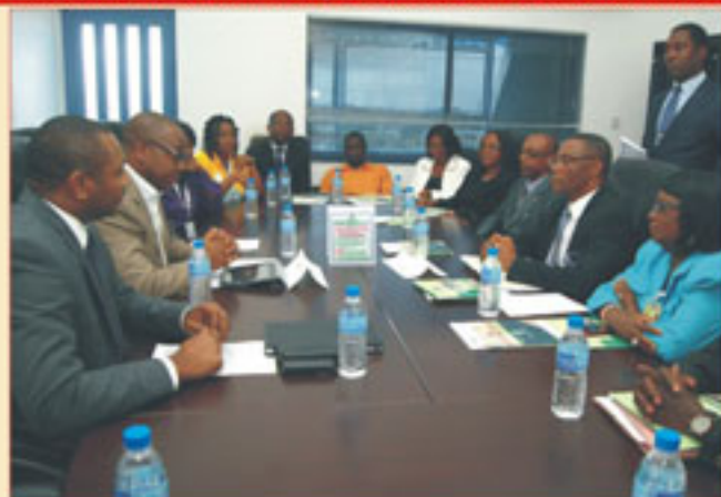
Officers of both organisations shortly before signing the MoU