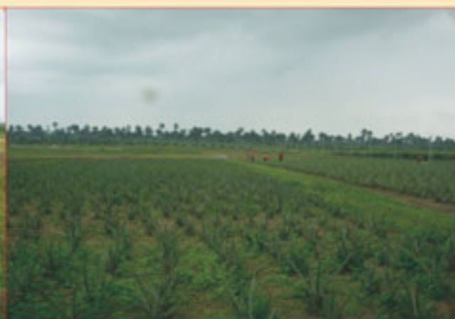
The pineapple orchard