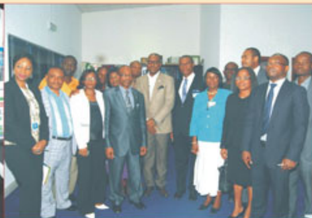
Group Photograph of senior officers of UniPort and RSSDA after the signing