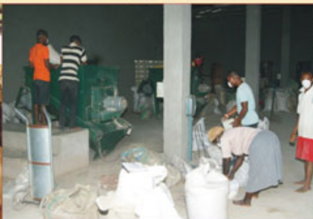
Workers at the Processing Unit