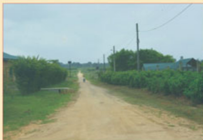
Landscape of a section of the Farm