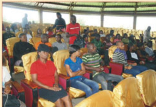
Cross section of Interns from the University