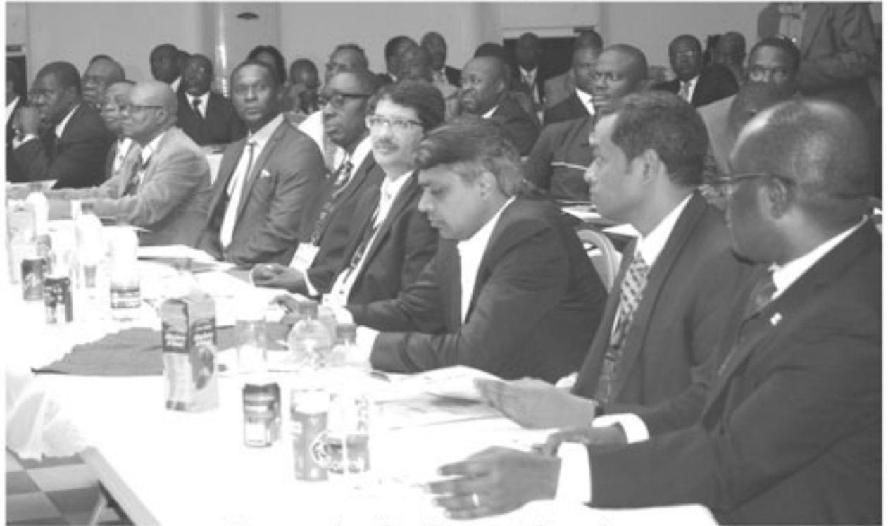
A cross section of participants at the conference

Recounting success story of how the acquisition of the former Eleme Petrochemical by Indorama turned