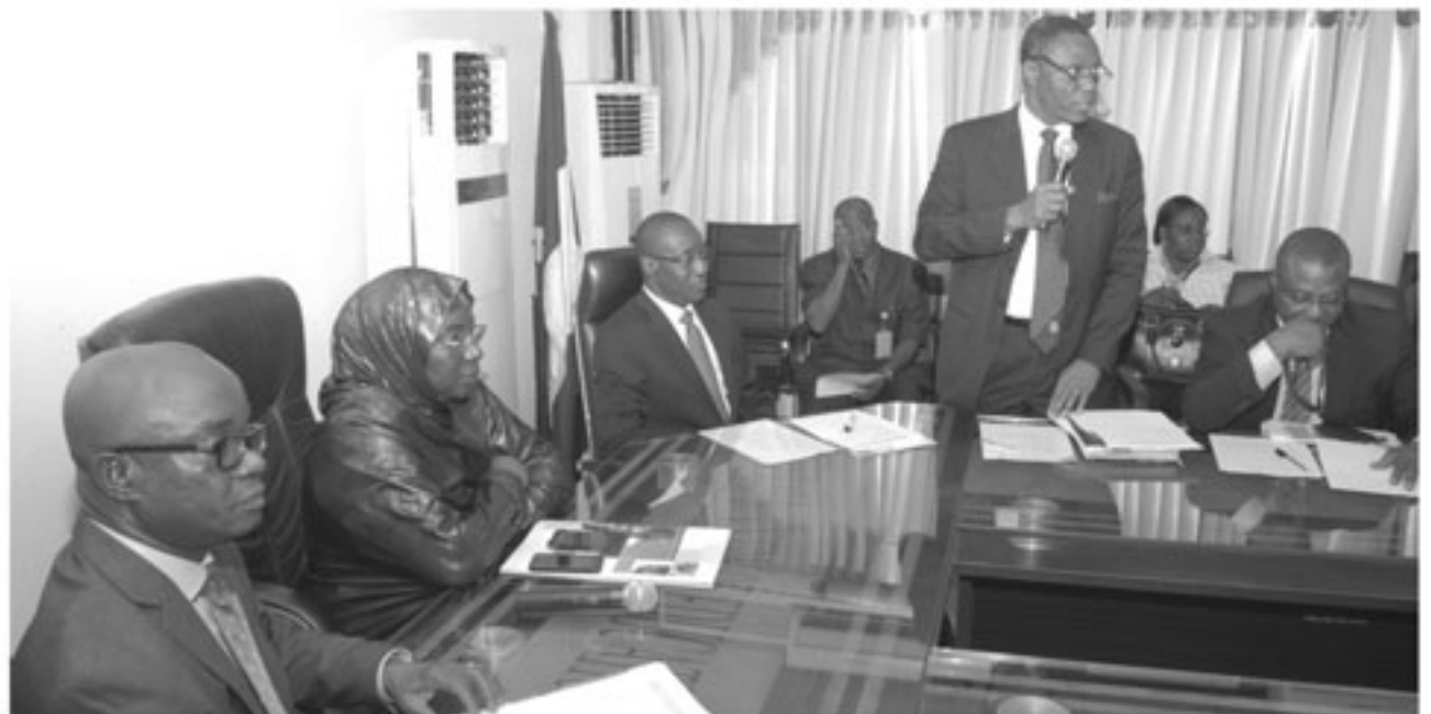
V-C, Prof Ajienka, making a presentation before the signing of MoU, while Hon Minister of Education, Prof Rufa'l, and others listen

The AVU is a pan- African Inter-governmental Organization established in 1977 and funded by the African Development Bank (AfDB) with a mission to increase access to quality higher education and training through the innovative use of Information and Communication Technologies (ICT), with its headquarters in Nairobi, Kenya.