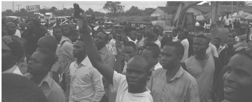
Protesting National Association of Nigerian Students