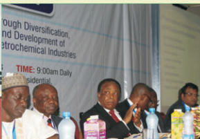
View of stakeholders at the Conference