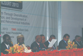
Resource Persons at the Conference