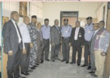
Senior Officers of the University and the Police team in a group photograph