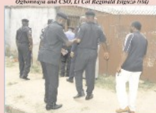
The Police team on arrival at the residential quarters for the officers