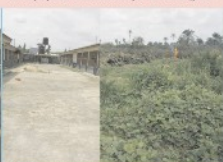
A view of the proposed Police residential quarters and site of the stadium