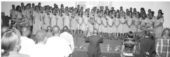
Members of UniPort Concert Chorus Performing