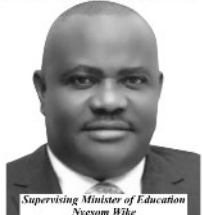
Supervising Minister of Education Nyesom Wike

project said that higher education in West and Central Africa had been a low priority for the past two decades.