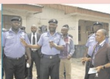
The Area Commander stressing a point during the inspection