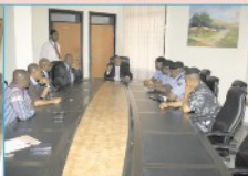
A view of UniPort Officers and the Police team at the meeting