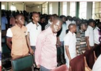
Students also rise for UniPort Anthem