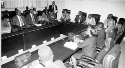
Some Principal and Senior Officers of the University in a photograph with some of the accreditation panel members