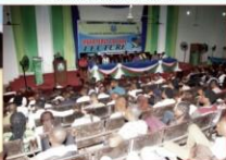
Participants listen in rapt attention to the Guest Lecturer on the rostrum