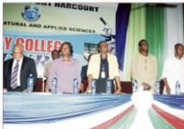
Guests rise for UniPort Anthem