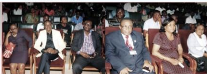
Cross section of the audience