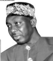
King Edward Asimini William Dappa Pepple III

FOR PORT HARCOURT AND ENVIRONS FOR SUNDAY, DECEMBER 14 TO SATURDAY, DECEMBER 21, 2014