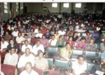
Students also listening to the Lecture