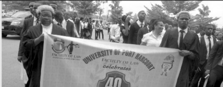
Staff and students of the Faculty of Law during procession

The Human Rights Lawyer, who explained the significance of the Charter to the administration of justice, said Magna Carta laid the foundations for most of the fundamental concepts in the legal system, adding that: " Magna Carta continues to inform our thinking about rights and liberty. When Eleanor Roosevelt introduced the Universal Declaration of Human Rights to the United Nations Assembly in 1948, she referred to it as an international Magna Carta for all humanity. Nelson