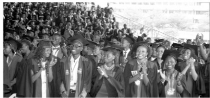
A Cross-section of the Matriculants

Right now, it is take-off time. So, fasten your seatbelt and get set on this defining journey to a destination of your choice. Meanwhile, I wish you exactly what you wish yourself—that is based on your preparation, your motivation and purpose! Let flight take off. Good luck folks!