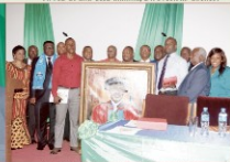
Sons of Diete-Koki (arrowed) holding a painting of their late father