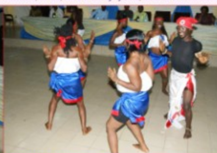
UNI PORT Arts Theatre Troupe, thrills the audience with Orukoro fertility dance