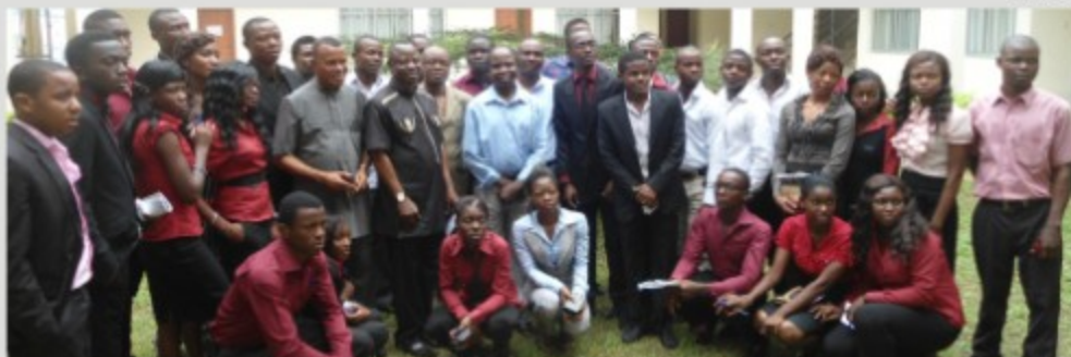
Students from both institutions with UNIORT Lecturers

Responding to why it has been unable to produce First Class graduates for a very long time, the Head of Department, who disclosed that the Department consisted of over 500 regular Undergraduate students and 18 academic staff, said that it had always placed a high premium on academic standards and that nothing short of high standards were required, adding that courses in the discipline were philosophical and abstract and as such demanded a high level of intellectual input which is a little more challenging than other disciplines. He expressed hope that in future, the Department would produce First Class graduates, especially with the new guidelines for computing degree results as approved by Senate of the University.