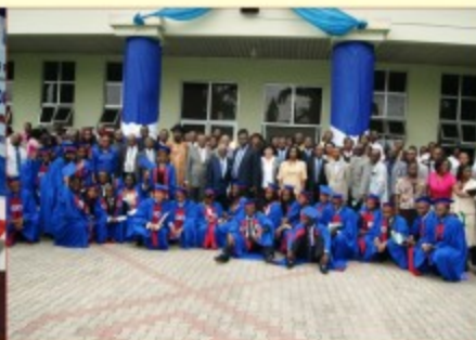
The new Pharmacists with Senior Colleagues and Officers of the University