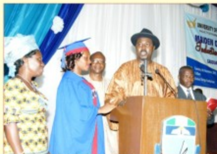
Representative of the Ag Registrar PCN, and the Valedictorian flanked by her parents