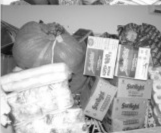
Some of the relief items at the Health Services Dept