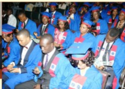
A cross section of the newly-inducted Pharmacists