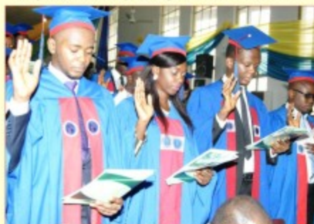
Some of the new inductees taking the Oath