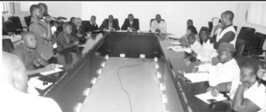
V-C addressing gentlemen of the press during the Media Briefing