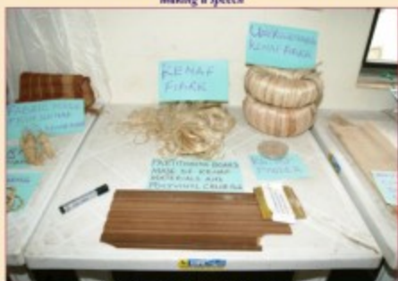
Exhibition of products made from Kenaf