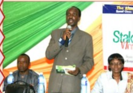
Representative of NOSDRA addressing the audience