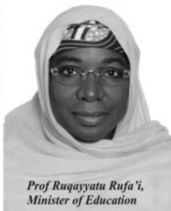
Prof Ruqayyatu Rufa'i, Minister of Education