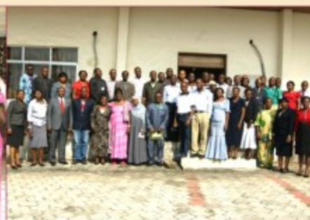
Group photograph of participants