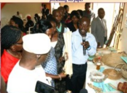
A Resource Person explaining a point to guests