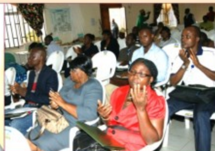
A Cross-section of the audience