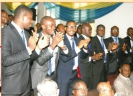
A cross section of the Inductees