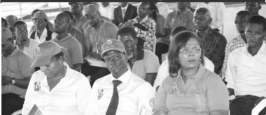
Cross section of participants at the event