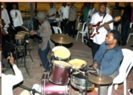
Members of the Rex Jim Lawson Memorial Band performing