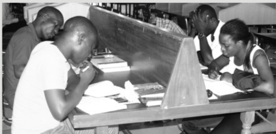
Cross section of students reading

The culture of reading purely for pleasure may be on the decline, the truth however, is that Nigerian students still read to acquire knowledge and pass examinations. This is in addition to the use of online resources as a few of them were seen with personal laptop computers in line with modern trends in library use. Who says the culture of reading is dying in Nigeria?