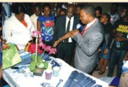
Chairman, Research Fair C'ttee, Keynote Speaker and other guests at the University Advancement Centre (UAC) stand