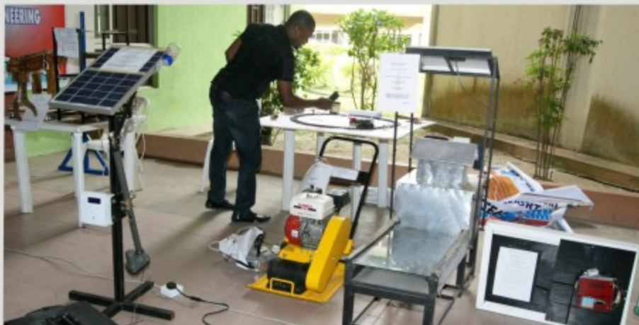
College of Engineering stand at the Research Fair

Now that the 2 nd Fair and Conference has been concluded, the Organizing Committee should begin in earnest to plan for the next edition. While the Committee is planning ahead, researchers should also prepare ahead to showcase new findings. It would be boring for guests, at the next Fair, to see the same things that were exhibited at this Fair. The preparations must begin now.