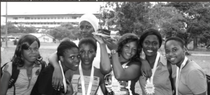
Winners of the female category displaying their trophy