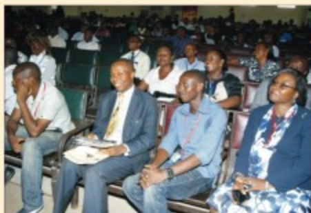
Participants at the opening ceremony