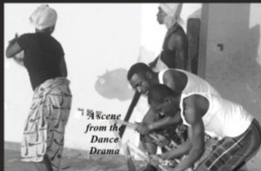
Scene from the Dance Drama