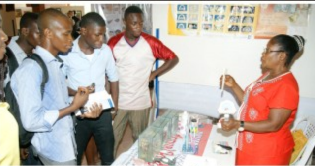
Faculty of Dentistry displaying its products