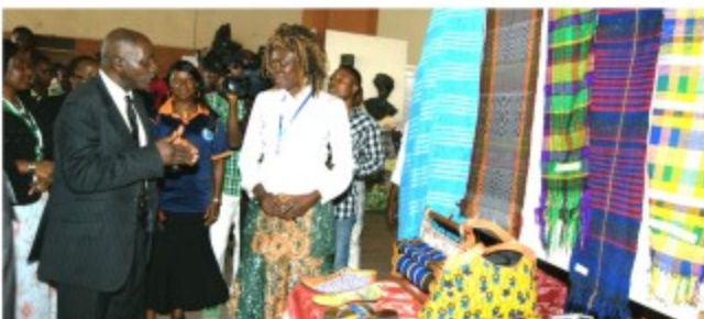
Woven Cloths, African print shoes and bags on display by Dept of Fine Arts and Design