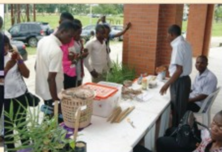
Guests at the Faculty of Agriculture Exhibition stand