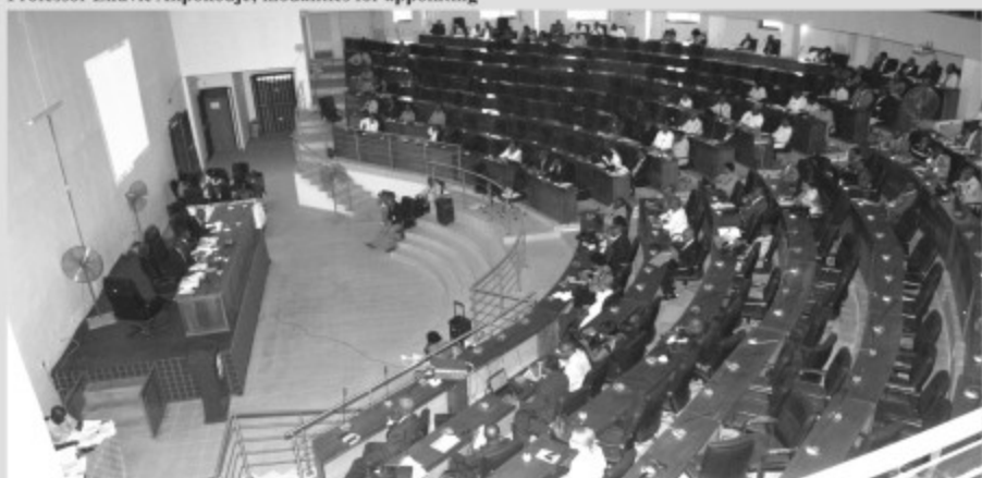
Senate in session