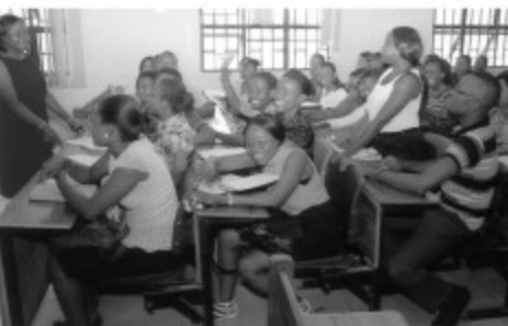
Pioneer Nursing Students and their Lecturers at practical sessions