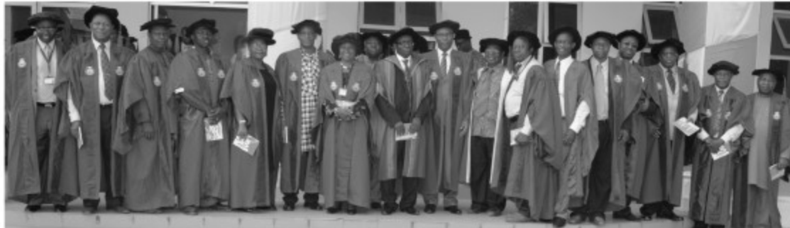
The Inaugural Lecturer, V-C, and some Professors before the Lecture