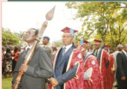
Visitor's procession led by the Mace Bearer