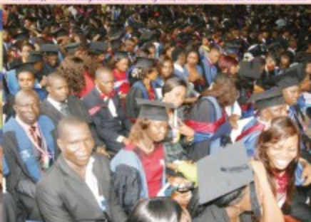
A Cross-Section of Graduands