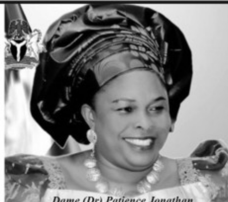
Dame (Dr) Patience Jonathan