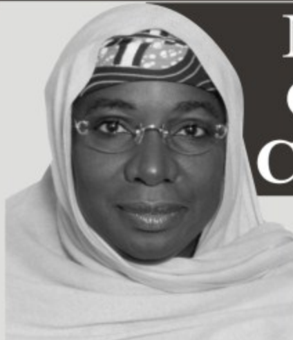
Prof Ruqayyatu Rufa'i, Minister of Education