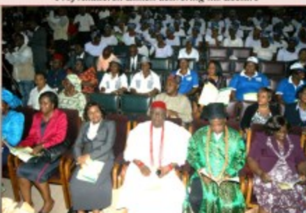
Cross-section of guests at the event