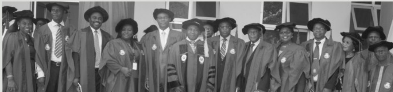
Inaugural Lecturer, V-C and some Professors before the Lecture