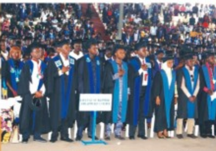
Some of the Matriculants taking the Oath