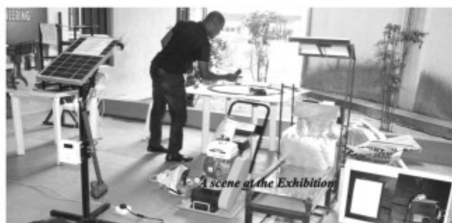
A scene at the Exhibition