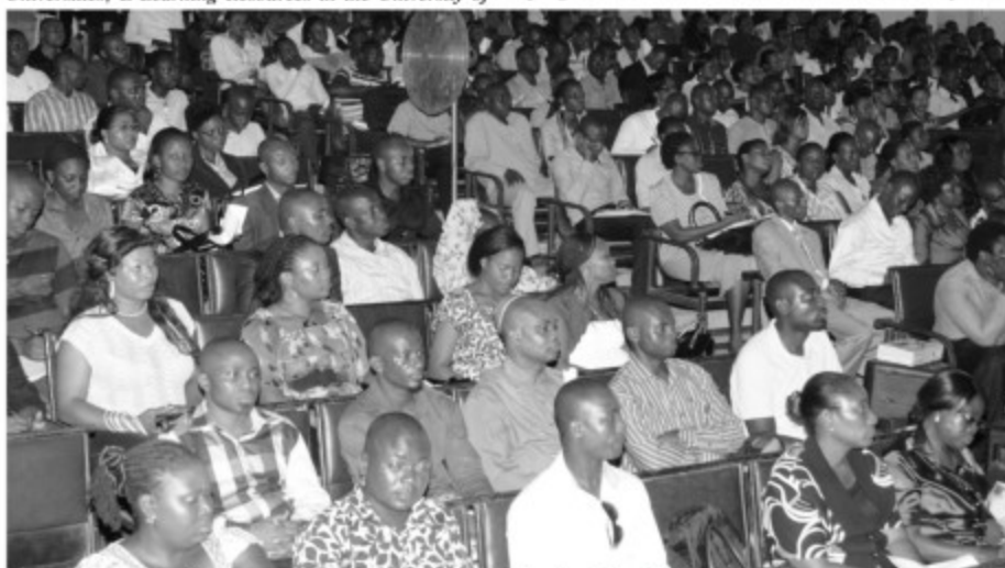
A cross section of participants during the Orientation exercise

It is important to state that graduate students should have a conducive academic environment for study. There should be well-equipped laboratory and library facilities that would enable students embark upon effective research work. The University authorities must be commended for ensuring that students gain access to e-resources that would expose them to a wide spectrum of knowledge. Much is expected of the students to justify the enormous resources expended by the authorities on the graduate programme. In the end, we expect the graduate programme to be the flag ship of a truly unique University that is bound to excellence. The transformation into a College is a major step in that direction.