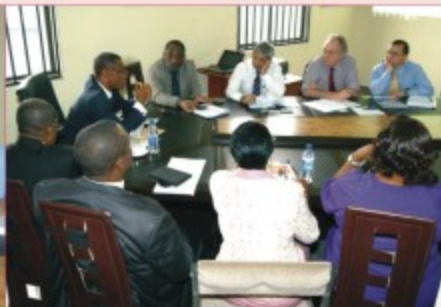
Both Teams at a Roundtable