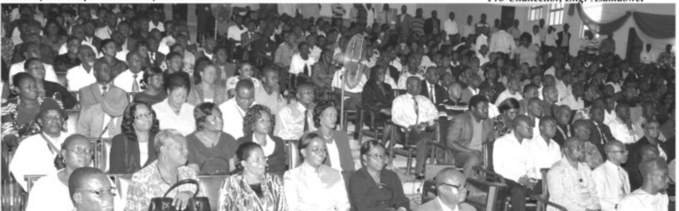
A cross-section of University staff at the meeting