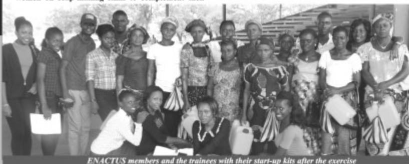
ENACTUS members and the trainees with their start-up kits after the exercise

Some beneficiaries of the training expressed gratitude to ENACTUS for the empowerment, promising to put the skills they acquired into practice to boost their earnings and also train other women in the community.