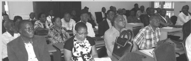
Cross section of participants at the Workshop