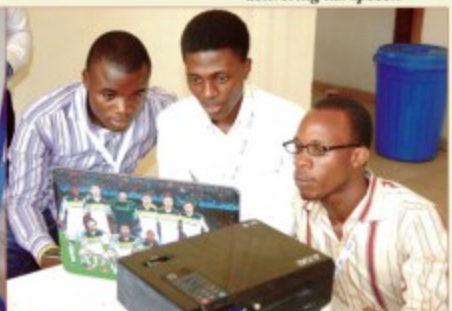
Google Team at the Exhibition Stand