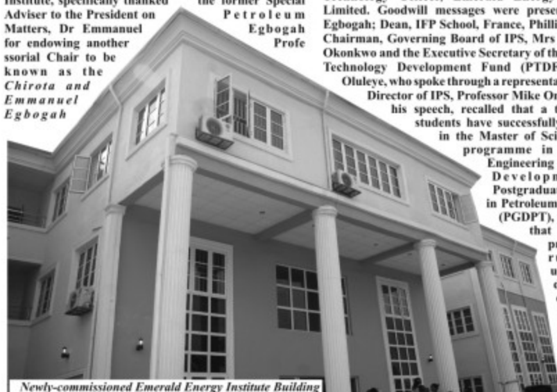
Newly-commissioned Emerald Energy Institute Building

Again, the Inductees made a 100 per cent success rate in the Associate Environmental Professional (AEP) examination that enabled them obtain International Certification of the National Registry of Environmental Professionals (NREP), United States of America. The week-long series of activities were rounded up with a dinner at the TOTAL Village following the Induction ceremony, Rumuogba in Obio/Akpor Local Government Area of Rivers State and an Alumni Luncheon at the IPS Park along the East/West Road on Saturday.