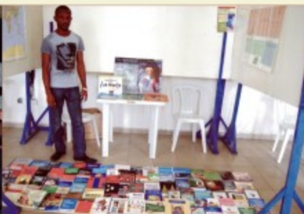
Exhibition Stand during the career fair