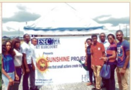
AIESEC Members during one of their outreach programmes titled: Project Sunshine