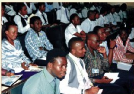
A cross-section of participants