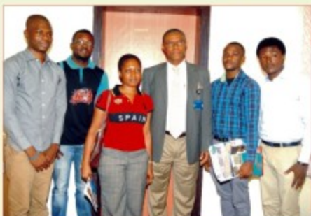
V-C, (3rd right) and AIESEC Team