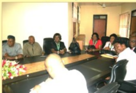
CON Delegates during the courtesy visit