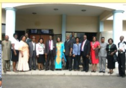
Group Photograph of CON Delegates with Principal Officers of the University