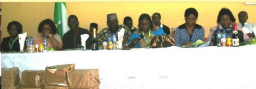
Guests at the High Table