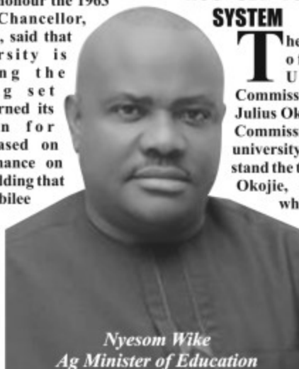
Nyesom Wike Ag Minister of Education

W ebster University, New Accra, Ghana has been approved by the Higher Learning Centre (HLC) in the United States to offer dually accredited degrees for its graduates. Following the approval by HLC, Webster University graduates will hold degrees that will be recognized in both Ghana and US. In addition to its Ghana and North America locations, Webster University has traditional residential campuses in Austria, the Netherlands, Switzerland, Thailand, and the United Kingdom.