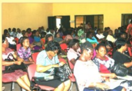
A cross section of participants