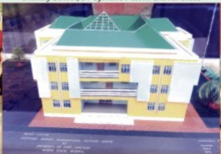
Prototype of the proposed multipurpose hall