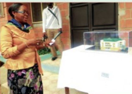
Mrs Ajenka giving a speech on the proposed building