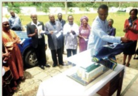
V-C, Prof Ajenka unveiling the project prototype