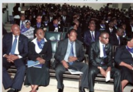
A cross-section of Registry Staff