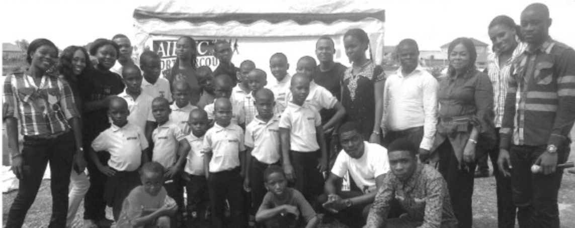
AIESEC members with staff and kids of some Orphanages