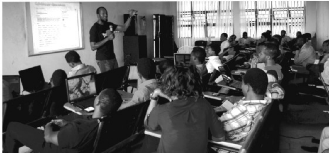
The Training in session