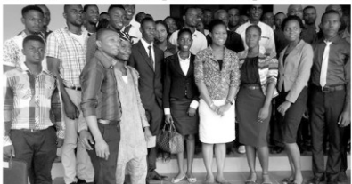
A group photograph of participants after the contest