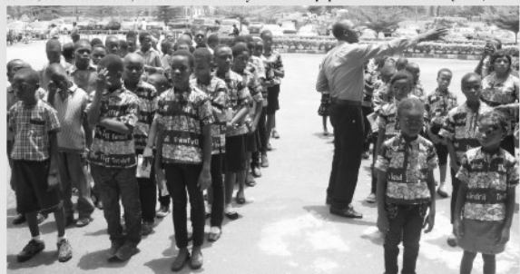
Pupils of Tendril Montessori School during their visit to the University