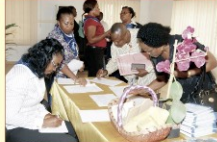
Participants registering for the Workshop, under the supervision of University of Port Harcourt Foundation staff