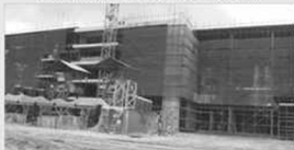
Central Bank of Nigeria Centre of Excellence Building