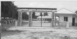
Scinje Lulu Briggs Children's Amusement Park