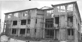
Department of Music Building