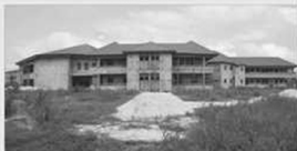
Faculty of Humanities Building