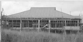
Shopping Complex Building