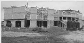
Mega Lecture Hall