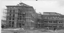
Central Office Building