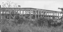
College Of Graduate Studies Building