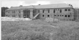
Hostel Building for Centre of Nuclear Energy Studies