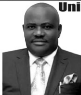
Nyesom Wike, Minister of State for Education