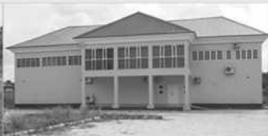
Centre for Nuclear Energy Studies Laboratory