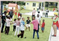
Children celebrating Nigeria's 54th Independence anniversary at the Park