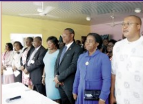
Dignitaries stand for National and UniPort Anthems