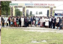
A group photograph after commissioning of the Park