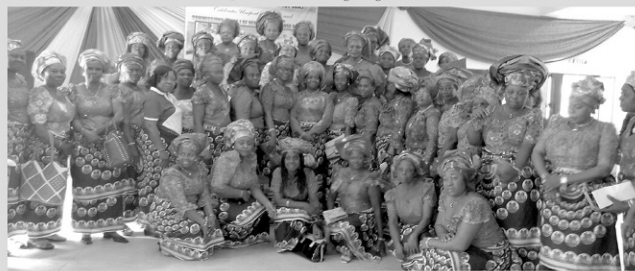
UPWA members in a group photograph after the commissioning

Highlights of the event were a rally, dance, drama by students of the Theatre and Film Studies and presentation of awards to distinguished personalities and Friends of UPWA.