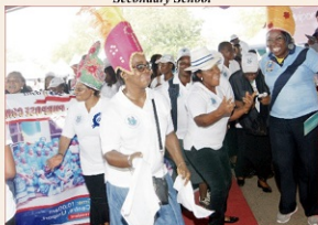
UniPort Women Association during the carnival