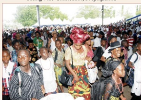
Students of University Demonstration Secondary School