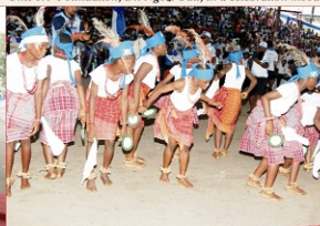
University Demonstration Primary School dance group performing at the event