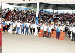
Cross section of participants