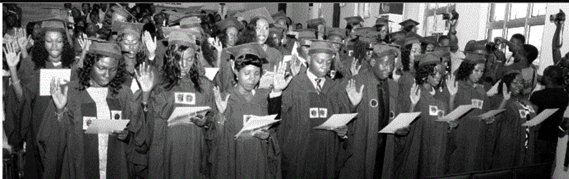
The newly-inducted Pharmacists taking the Pharmacists' Oath

The Registrar, who emphasized the need for the Inductees to get themselves acquainted with the code of professional ethics which prescribes professional and moral responsibilities to their patients, colleagues, employers and the general public, disclosed that the Council has institutionalized a programme known as Continuing Professional Development (CPD) to ensure continued relevance of Pharmacists in the health sector. He informed the new members of the Council that appropriate sanctions