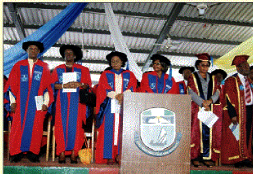
Provosts and some Principal Officers rise for the National and UniPort Anthems