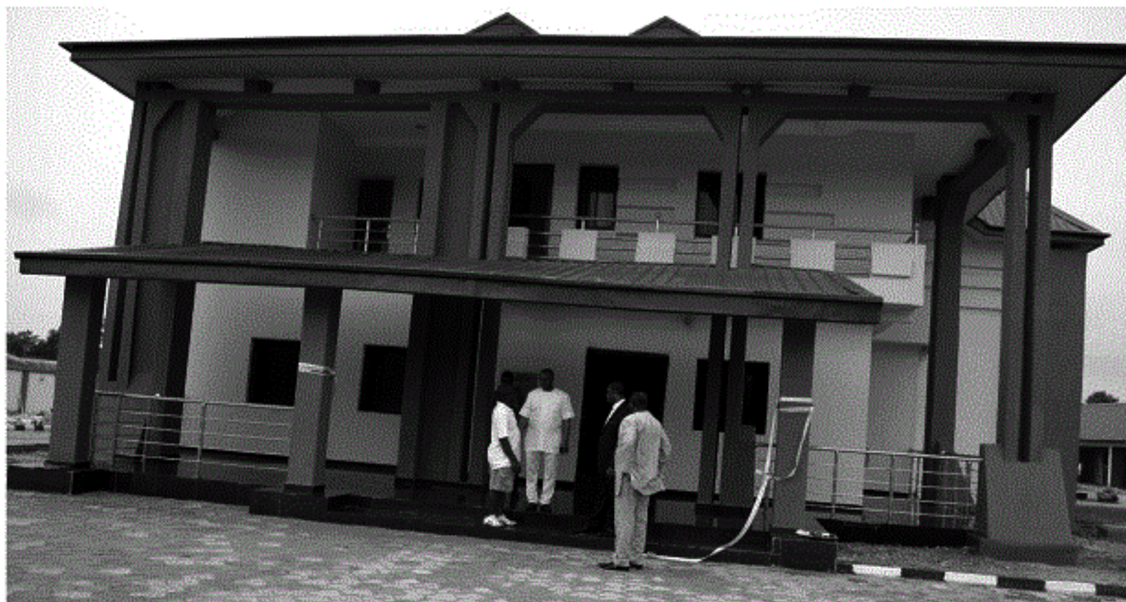
A front view of the Professorial Guest House