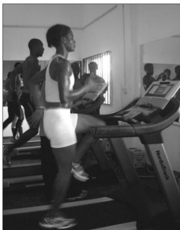
Athletes sweating it out at the Gym

Available training exercises in the Gym include: Running on the treadmill, the stepper, the multi-station gym, seated (overhead) press, bench press, uni-station gym, and back extension, reverse abdominal crunches, upright row and bent-over row, amongst others.